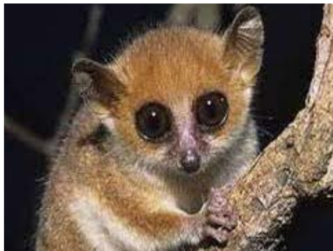
Dense dry forest

Financial support from FAPBM to the Harmonious Protected Landscape of Menabe Antimena began in 2022 . This funding ensures the implementation of conservation activities, and covers part of the salary and operating costs.