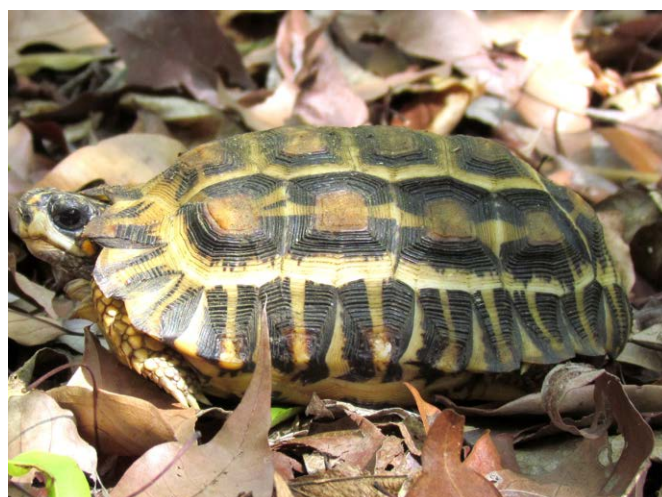
Flat-tailed turtle