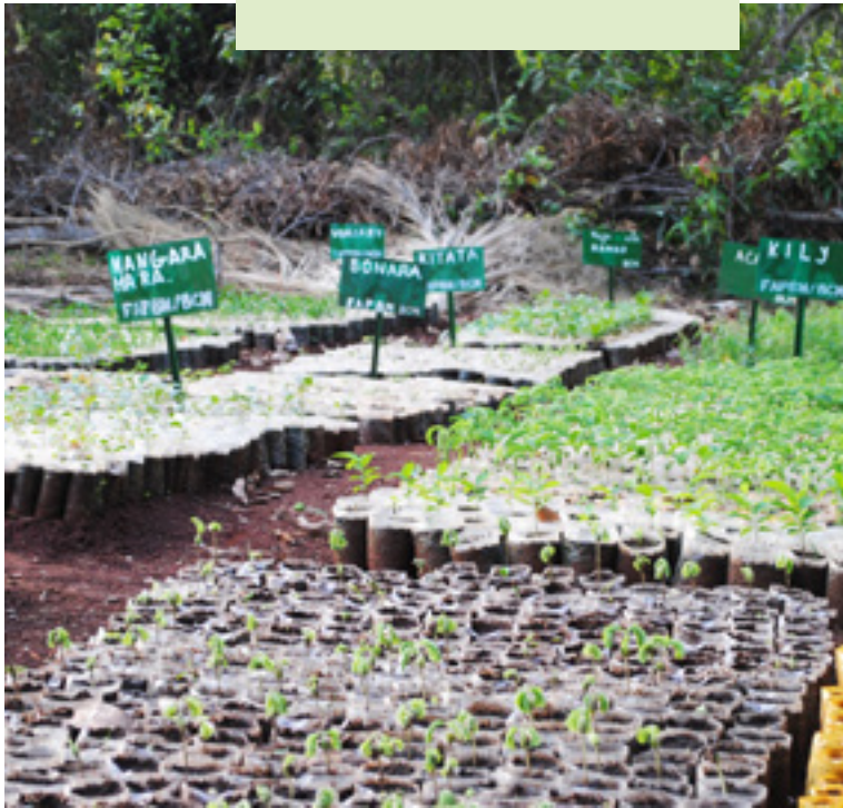
Tree nursery

*indicates the conservation status of protected areas on a scale of 5, with 5 being the highest score